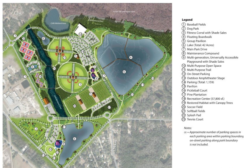
Expanded Yulee Regional Park Alt. Conceptual Park Site Master Plan

Nassau County Parks is requesting engineering and landscape architecture design services for the expansion of the Yulee Regional Park complex located at 86142 Goodbread Road, Yulee, FL 32097. Nassau County Parks proposes to use approximately 5-acres of the existing wooded area within the park parcel to create additional space for three multi-use field improvements. The proposed programming generally consists of an access driveway from Pages Dairy Road, a supporting parking lot, three multi-use fields, siting two pavilions, sidewalks and coordinating lighting placement. Project programming is based on the Conceptual Park Site Master Plan within the 2024-2025 FY Capital Improvement Plan, an initial project meeting held on August 14, 2024 with the Client, and an email from Jay Robertson on August 26, 2024. Per a meeting with the Client on September 17, 2024 it is understood that Kimley-Horn has been requested to remove photometric plans from this scope and will coordinate lighting placement only with Musco Lighting.